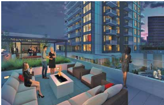
1 Elegant double height lobby with seating 2 Fully equipped fitness facility with state-of-the-art exercise equipment 3 Yoga/Pilates deck 4 Yoga/Pilates studio 5 His change room with shower 6 Infrared sauna 7 Steam room 8 Her change room with shower 9 Guest suite 10 Social lounge club with kitchen and fireplace 11 BBQ area with large harvest table 12 Social lounge seating with fire pit 13 Zen terrace with seating and water feature